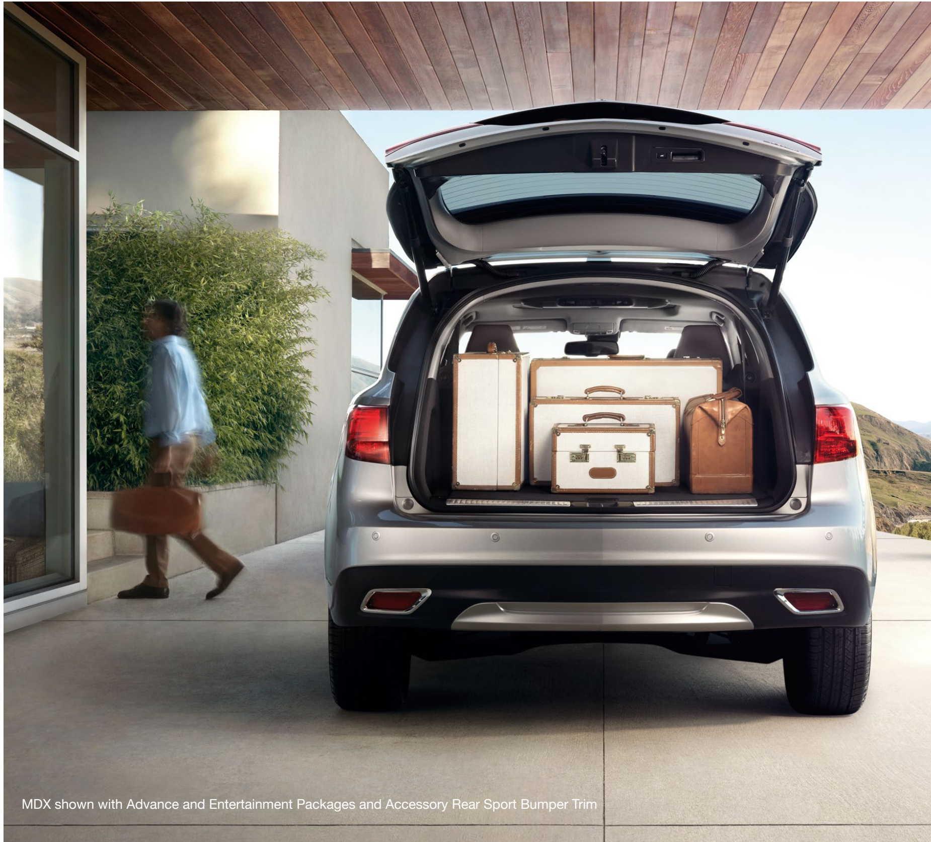
MDX shown with Advance and Entertainment Packages and Accessory Rear Sport Bumper Trim