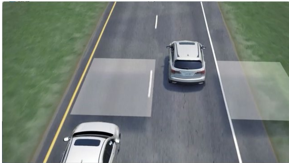
MDX shown with Advance Package