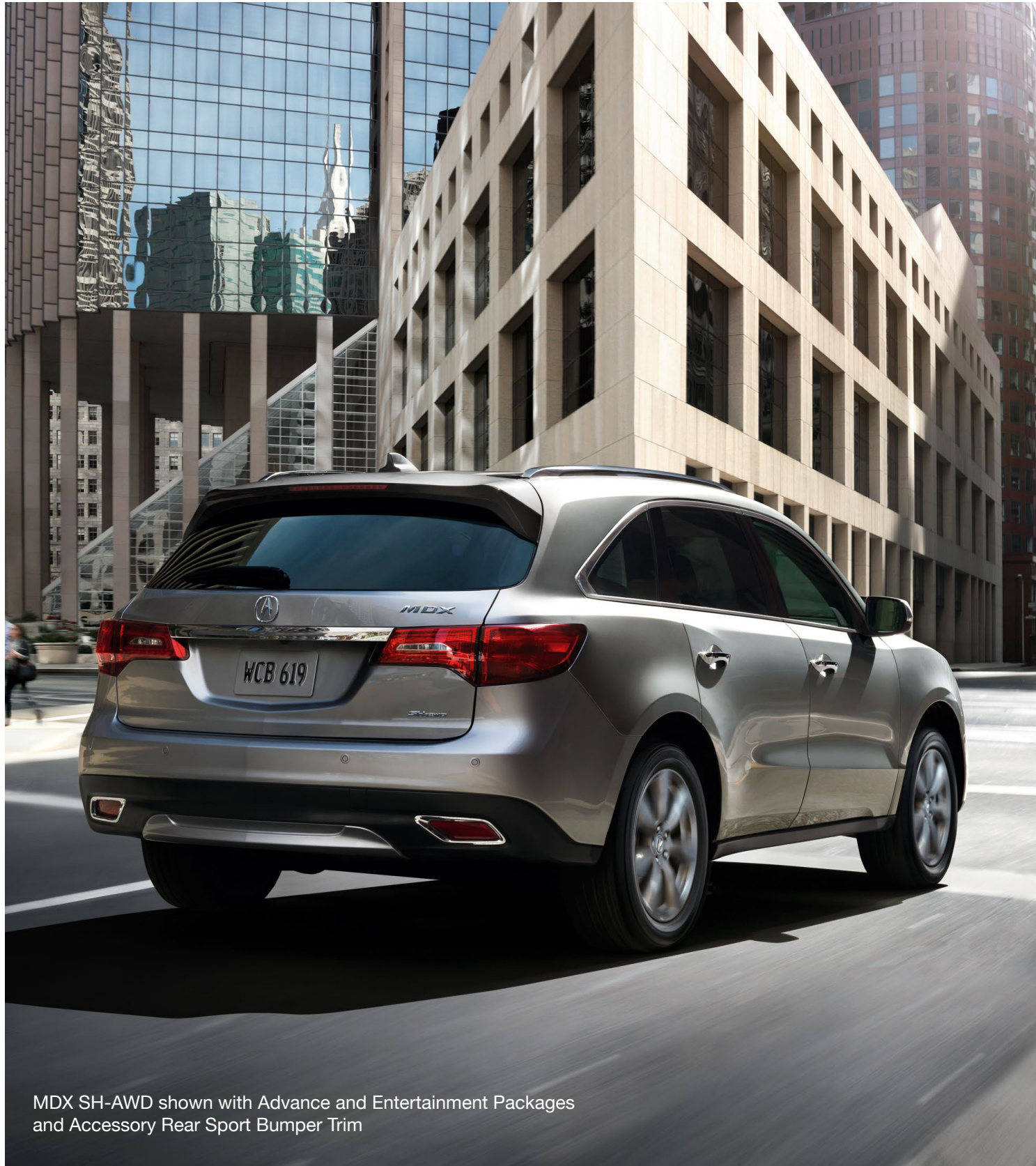
MDX SH-AWD shown with Advance and Entertainment Packages and Accessory Rear Sport Bumper Trim