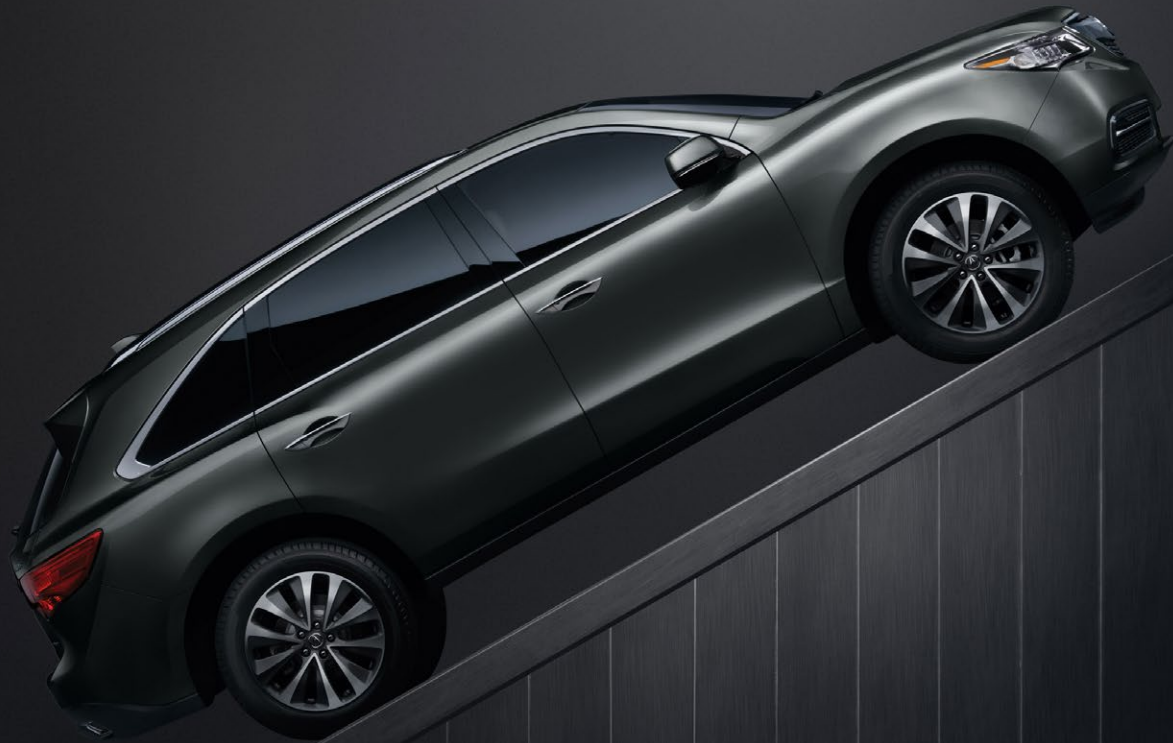
MDX shown with Technology Package and Accessory Roof Rails

It does much, so you can do less. Advanced engineering on the MDX helps make you a better driver. And most of the time, you won't even know it's happening.